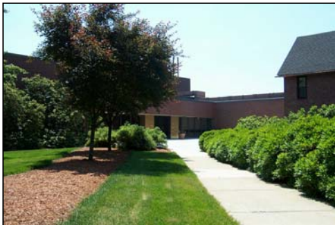
99 Hayden Avenue

For additional information or to arrange a tour, please call Bruce Lee at 781-676-2990. This is an outstanding opportunity for a client to occupy space immediately, at a cost effective lease rate.