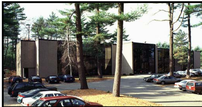
54 Middlesex Turnpike